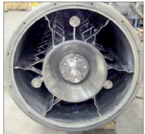
Rotors before and after servicing by LCI.