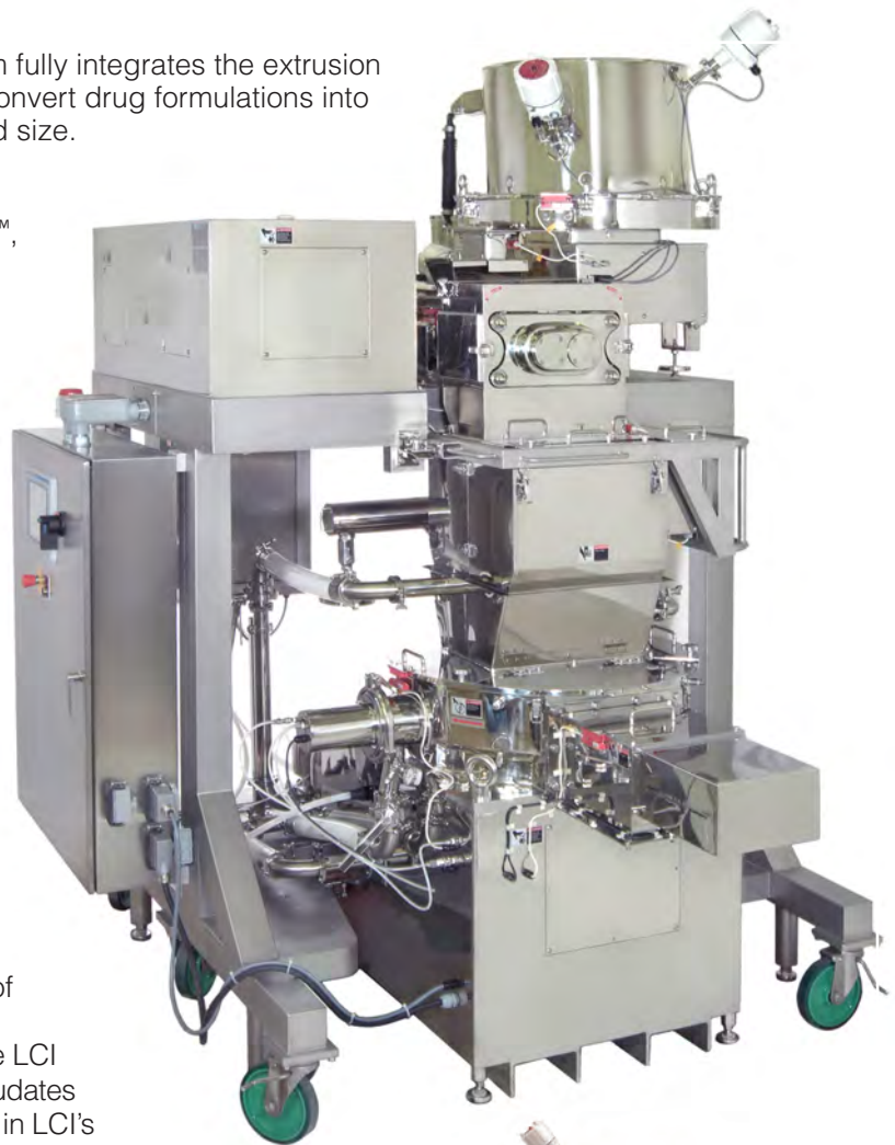
Above: LCI's Continuous Drug Pelleting System shown with the Radial Xtruder Model EXDS-100G, Discharge Device Model CD-30, and Marumerizer Model QJ-700TG.