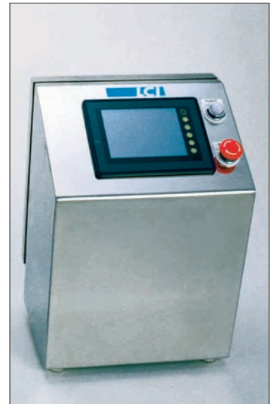
The LCI Multi Granulator is supplied with a touch screen control panel.