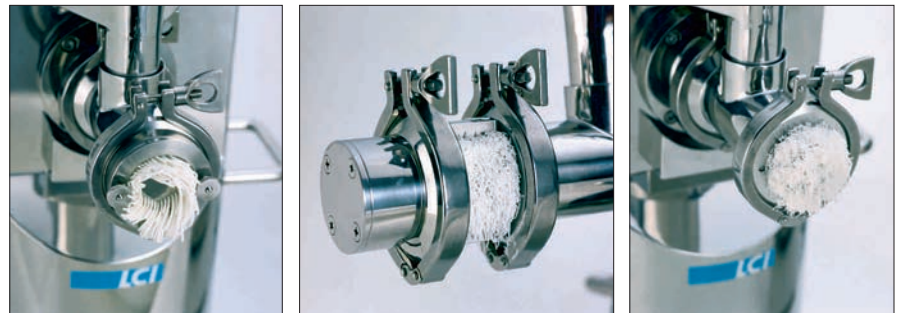
Three types of extrusion—axial, radial, and dome—can be evaluated by simply changing the extrusion head.