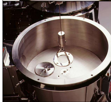
Above: Screens inside the twin bowls. Left: Systems are available with either manual or automatic integrated plate lifting devices. Below: Twin Bowl Marumerizer system.